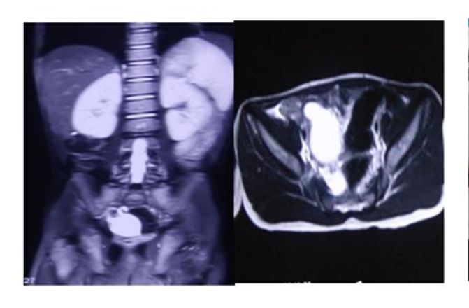
Case 2 Fig-1 CT Abdomen showing enteric duplication cyst in the abdomen

Post-operative recovery was excellent with hospital stay 5-6 days. On gross examination of ileal cyst of size 5x3 cm and attached the ileum. Histopathological diagnosis was intestinal duplication cyst. Post-operative follows up after 2 months, with no scar of the abdomen and boy was healthy. (Case 2. Figs. 1, 2, 3, 4, 5).