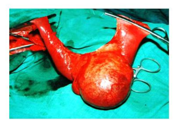
Case 1 Fig-4 photographs showing total excision of enteric duplication cyst

Under general anaesthesia abdomen was painted and draped. A 5 mm umbilical incision taken and Pneumoperitoneum created by varies needle and 5 mm port was inserted. There was a cystic lesion 5x3 cm, arising in the ileum and confirms the diagnosis of a duplication cyst. An additional 3 mm port inserted at right upper side of the public symphysis and left lower abdomen Mc-Burning point and 3 mm trocar was placed in each incision. An intestinal clamp and dissecting forceps were placed. Pneumoperitoneum was established with the pressure of 10-12 mm of Hg. Laparoscopically we checked the mobility of