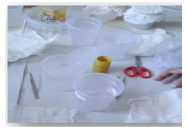
3. Take a wide mouthed jar