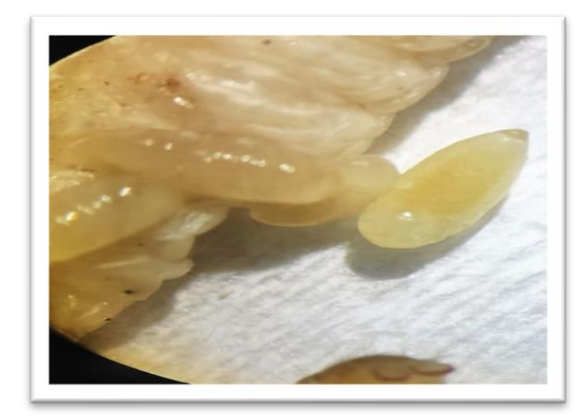
Late instars of Bracon