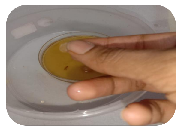
2. Dipping of cotton balls in honey solution and squeezing extra honey