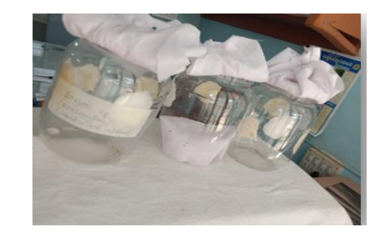
11. Emerged adults released in another container for mating purpose