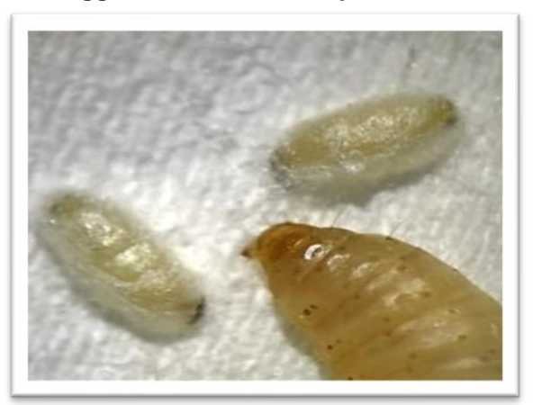
Pupa of Bracon