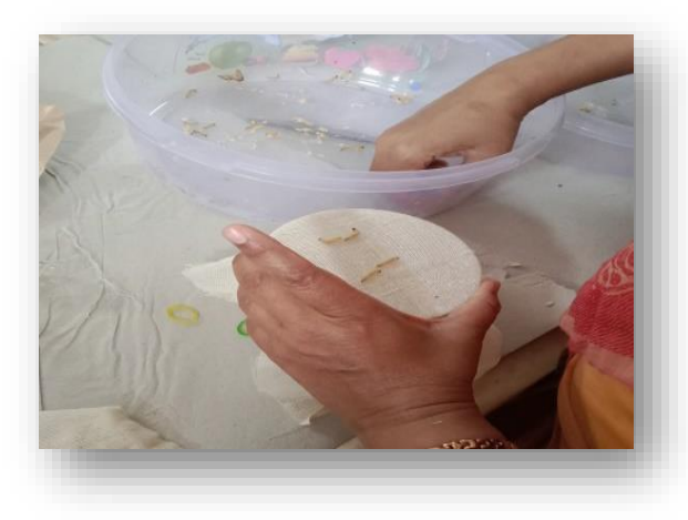
7. Add 10-15 Corcyra bigger larvae on muslin cloth

Godavari et al.; J. Exp. Agric. Int., vol. 46, no. 9, pp. 464-471, 2024; Article no.JEAI.122920