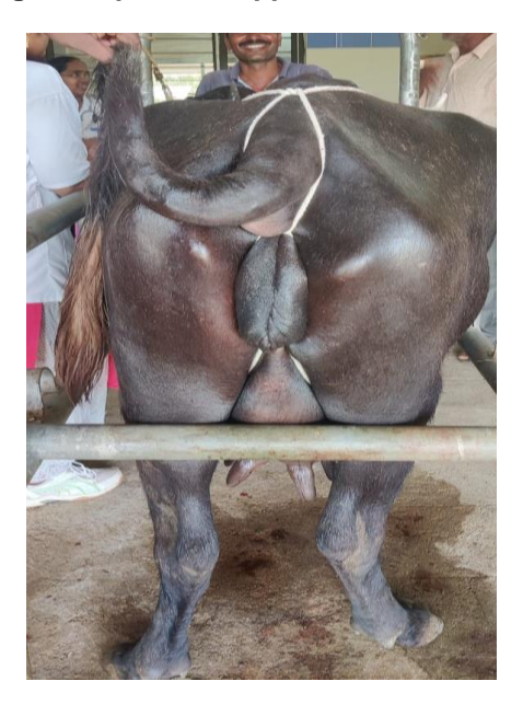
Fig. 4. Rope truss applied – rear view