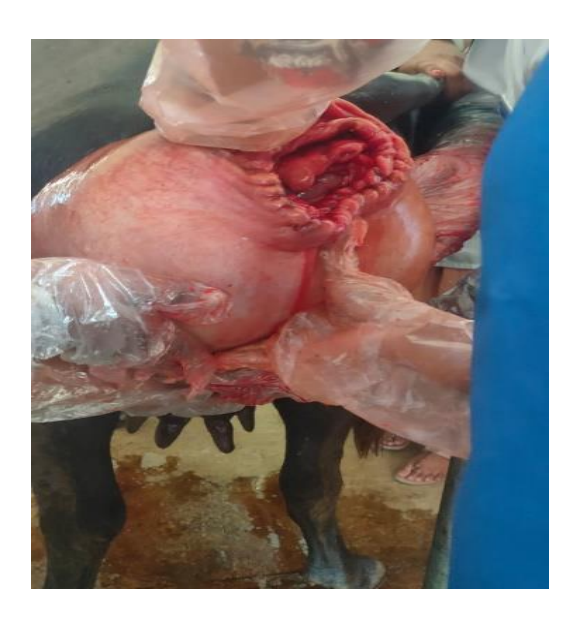
Fig. 2. Lifting the prolapsed mass for repositioning