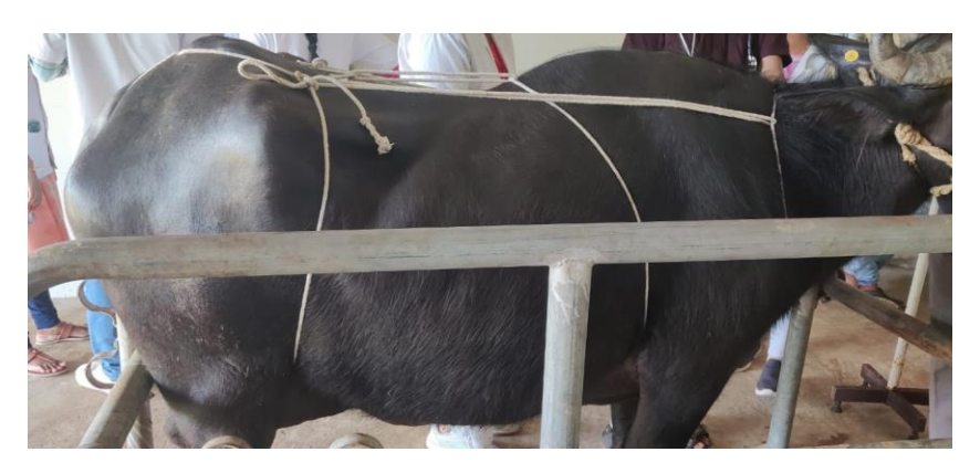
Fig. 3. Rope truss applied - Lateral view