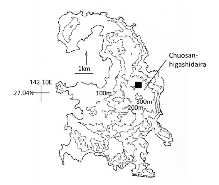
Fig. 1. Location of the study site on Chichijima Island, Ogasawara, Micronesia