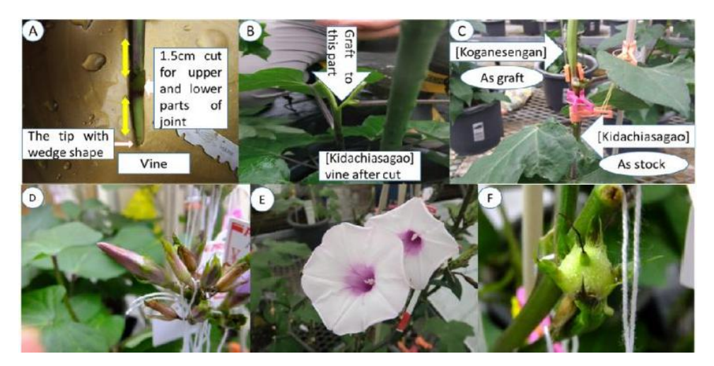
Fig. 1. Grafting process between [Kidachiasagao] and sweet potato [Koganesengan] and their flowering and seed formation in the graft of [Kidachiasagao] and three varieties. A. Graft making of [Koganesengan]; B. Stock making of [Kidachiasagao]; C. Mounting graft in stock; D. Buds of [Beniazuma] staged at one day before anthesis for pollination; E. Flower of [Narutokintoki] at anthesis; F. Fruiting of [Koganesengan]

According to the report from Murata [22], the lower seed set rate resulted in the abnormal embryo sac formation within which the normal female gamete could not be formed. On the other hand, in general, the rate of pollen germination in almost all varieties of sweet germination are not considered as the direct reason for the lower seed set rate [22]. In this study, it is considered according to the report of Murata [22] that the [Narutokintoki] used as maternal parent gave only 0 ~ 2% seed set rates, as the female gamete may be stopped during their developmental process. However, the [Narutokintoki] gave the similar seed set rates (63.9 \sim 52.4\%) compared with the others (46.1 \sim 60.0%) when used as pollen parent, indicating that the few pollens may not affect their own seed set rate. In addition, C/B gave the values from 0 to 2.4 in all of the combinations (Table 3), and the number of seeds/fruit obtained in this study was similar to that of OKARC (by personal commutation).