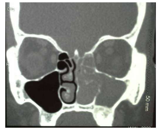
Fig. 2. Coronal CT Scan showing the left heterogenously - enhancing nasal tumour

Pernasal excision of the mass was done. There was moderate intraoperative bleeding thus BIPP (Bismuth Iodoform Paraffin Paste) gauze was used to pack the nose. The pack was removed