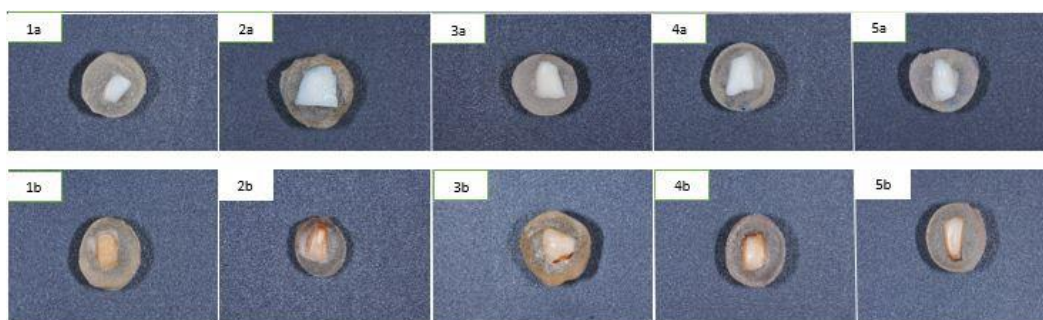
Figure 2. The color change images ( \Delta E ) at the 28-day interval after immersion in coffee solution. 1 = control group, 2 = microabrasion, 3 = microabrasion + fluoride polishing, 4 = macroabrasion + microabrasion, 5 = macroabrasion + microabrasion + fluoride polishing, a = immersed in distilled water, b = immersed in coffee.