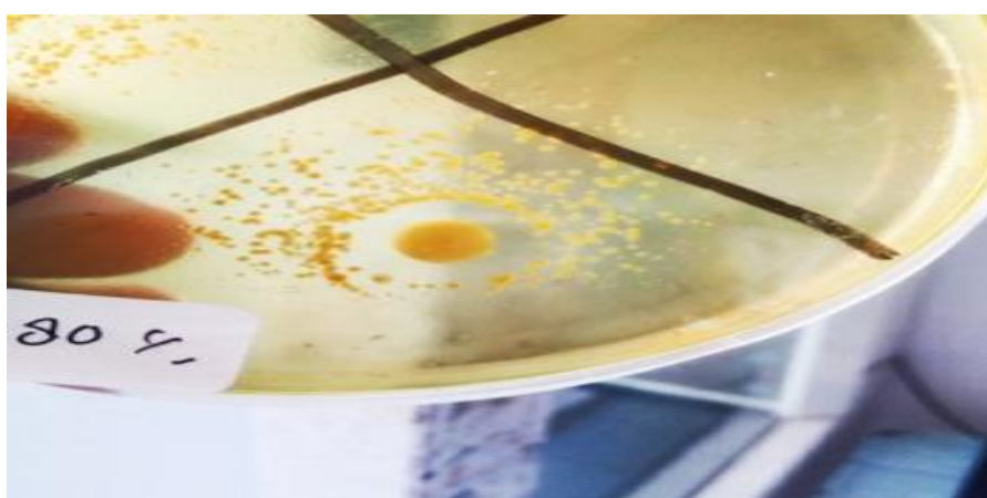
Fig. 3. Inhibition zone of star fruit extract against Vibrio cholera

The content of secondary metabolite compounds (flavonoid, tannin) in star fruit extract is able to inhibit the growth of Vibrio cholera through inhibiting cytochrome c-reductase, so that the metabolism of microbial cells is disrupted [5]. The inhibition of this metabolic activity will result in the death of bacterial cells. Flavonoid also play a role in reducing energy metabolism by inhibiting the use of oxygen by bacteria, thus preventing the formation of energy in the cytoplasmic membrane and inhibiting bacterial motility which plays a role in antimicrobial activity.