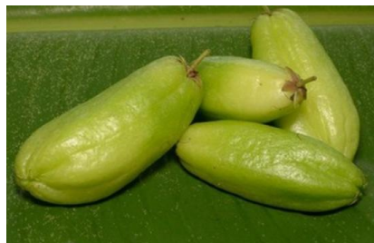
Fig. 1. Star fruit

LB : Lactose Broth. NA : Nutrient Agar PW : Pepton Water. RBD : Randomized block design TCBS : Thiosulfat Cytrat Bile Salts Sucrose, TPC : Total Plate count VC BSFIL : Vibrio cholera Bali Sea Food Inspection Laboratory '