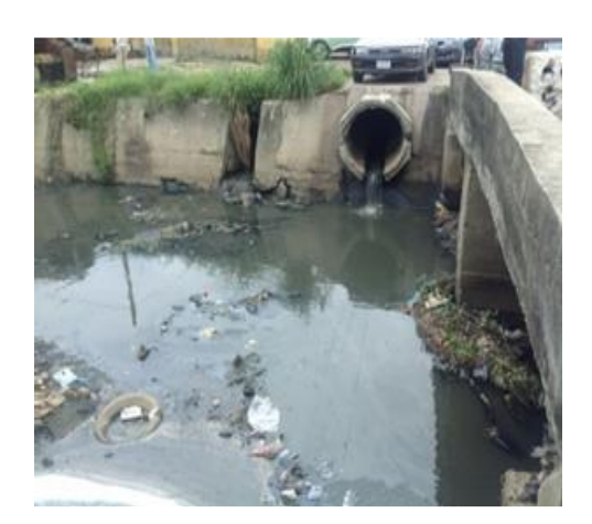
Plate 2. Ntanwogba creek showing discharge of wastewater into the drains