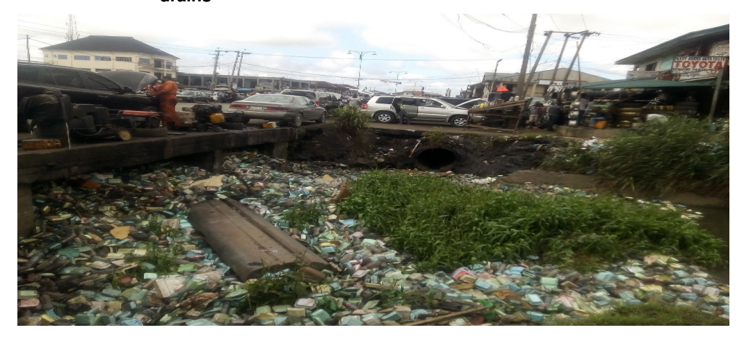
Plate 3. Blockage of water channel with assorted (especially Xenobiotic) waste products associated with anthropogenic activities around the creek in Port Harcourt