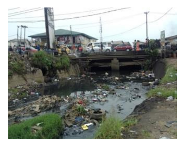
Plate 1. Status of open drainage systems in Port Harcourt metropolis showing indiscriminate dumping of wastes materials causing blockage of drains

contaminated areas. Most contaminants of concern are chemically and biologically reactive and rapidly become associated with particles in freshwater systems. Consequently, uptake or sorption onto particles is the primary mechanism for removing chemically reactive contaminants from the water column, and sedimentation is the principal mechanism for the accumulation of these contaminants in off-site areas over long time periods. Therefore this study was undertaken to determine the physico-chemical characteristics of wastewater and sediments from the open drainage system to evaluate the effect of human activities and its effect on water sources and the environment because of the beehive of socioeconomic activities along the creeks.