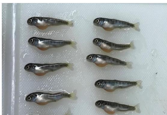
Fig. 2. Showing lethargy, swollen belly, and increased early life-stage mortality due to Thiamine Deficiency in Chinook Salmon. Photo Plate retrieved from Heather, 2022. [41]

Clinically, thiamine deficiency in farmed fish presents with symptoms such as nervous system problems, pale body colour, anorexia, regurgitation of blood, erratic swimming, and physical wounds and haemorrhages on the body surface [39 and 97]. Severe cases can lead to mass mortality, particularly when stocking densities are extremely high. Thiamine deficiency complex (TDC) was first documented in Pacific Coast salmonids in the USA, with Chinook salmon fry exhibiting swimming irregularities, lethargy, swollen belly, and increased early life-stage mortality [41]. Fig. 2: Evaluating Thiamine Deficiency in Chinook Salmon at the Fish Conservation Physiology Hatchery during fingerling production [41].