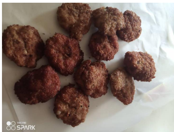
Fig. 2. Sample of freshly produced chicken nugget

The effects of packaging materials on the proximate composition of chicken nuggets stored at different temperatures for 30 days provided valuable insights into the impact of packaging on food composition quality [24]. The results indicate that the type of packaging material used can significantly affect the composition of chicken nuggets, with clear differences observed in terms of moisture content, protein levels, and lipid oxidation. Also, the storage temperature plays a crucial role in determining the rate of deterioration of chicken nuggets, highlighting the need for careful consideration when selecting packaging materials for food products [25].