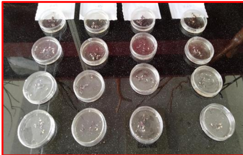
Fig. 3. Dipping of excited seeds of Melia dubia in tetrazolium solution