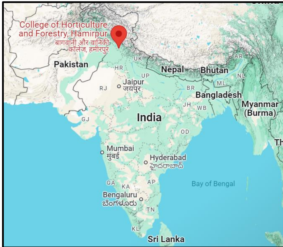
Fig. 1. Geolocation of fruit collection of Melia dubia for the present research study

was drained out and seeds of Melia were washed in distilled water. Then, red- or purple-coloured seeds were counted as viable seeds and non-coloured seeds as non-viable seeds (Fig. 4).