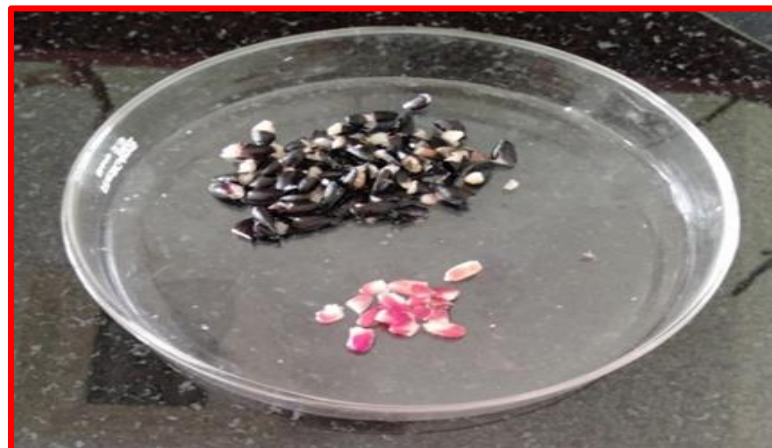
Fig. 4. Data recording of purple-coloured seeds as viable and non-coloured seeds as non-viable seeds of Melia dubia