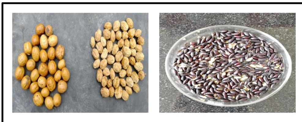
Fig. 2. Extracted drupes from fruits after removing pulp and extracted seeds or kernels from the dried drupes of Melia dubia