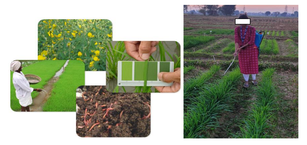
Fig. 3. Integrated nutrient management approaches