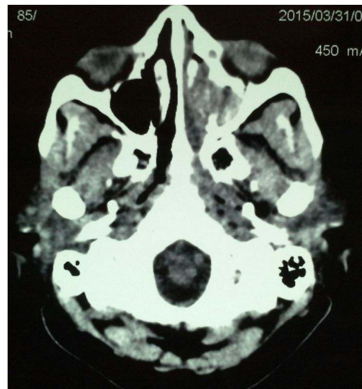
Fig. 1. Axial CT scan of the nasal cavities showing the tumour in the left nasal cavity

Pre and post contrast CT scans were taken and these showed a left nasal mass with heterogeneous enhancement and mixed density with remodeling or erosion of the lateral wall as shown in Figs. 1 and 2. There was associated stasis of fluid in the maxillary, sphenoid and ethmoidal sinuses.