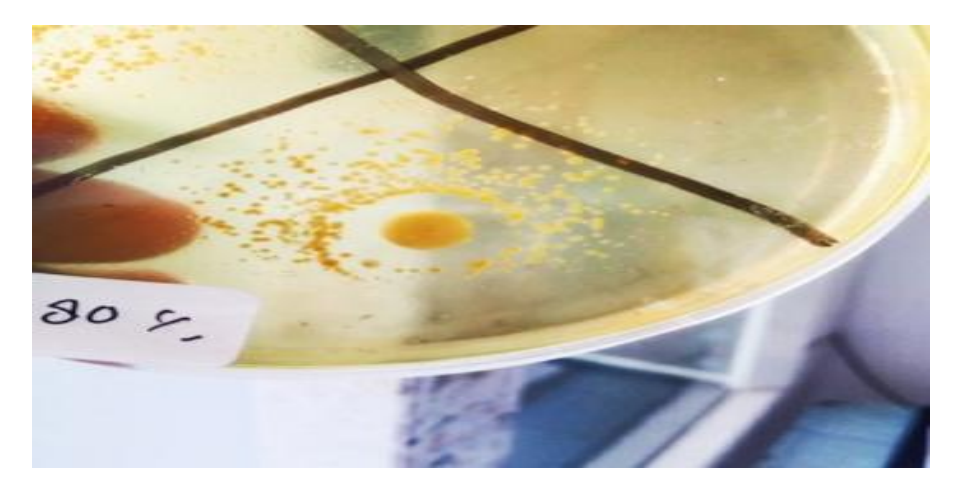
Fig. 3. Inhibition zone of star fruit extract against Vibrio cholera

The content of secondary metabolite compounds (flavonoid, tannin) in star fruit extract is able to inhibit the growth of Vibrio cholera through inhibiting cytochrome c-reductase, so that the metabolism of microbial cells is disrupted [5]. The inhibition of this metabolic activity will result in the death of bacterial cells. Flavonoid also play a role in reducing energy metabolism by inhibiting the use of oxygen by bacteria, thus preventing the formation of energy in the cytoplasmic membrane and inhibiting bacterial motility which plays a role in antimicrobial activity.