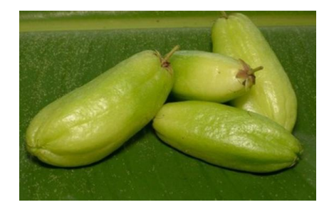
Fig. 1. Star fruit

Star fruit (Fig. 1) is the result of the plants that are often found in people's yards, maximum height of 10-15 m, grows naturally and is rarely commercialized. Flavonoid and saponin compounds are antimicrobial compounds that are very effective in inhibiting the growth of viruses, bacteria and fungi as well as easily soluble in polar solvents such as ethanol, butanol. and acetone. Likewise, alkaloids have the ability as an antibacterial by interfering with the constituent components of peptidoglycan in bacterial cells, while tannin are polyphenolic compounds (C6-C3-C6) that precipitate proteins and form complexes with polysaccharide, resulting in microbial cell walls lysis.