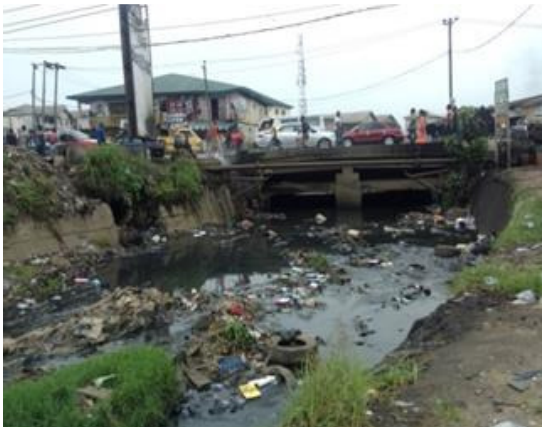
Plate 1. Status of open drainage systems in Port Harcourt metropolis showing indiscriminate dumping of wastes materials causing blockage of drains

contaminated areas. Most contaminants of concern are chemically and biologically reactive and rapidly become associated with particles in freshwater systems. Consequently, uptake or sorption onto particles is the primary mechanism for removing chemically reactive contaminants from the water column, and sedimentation is the principal mechanism for the accumulation of these contaminants in off-site areas over long time periods. Therefore this study was undertaken to determine the physico-chemical characteristics of wastewater and sediments from the open drainage system to evaluate the effect of human activities and its effect on water sources and the environment because of the beehive of socioeconomic activities along the creeks.