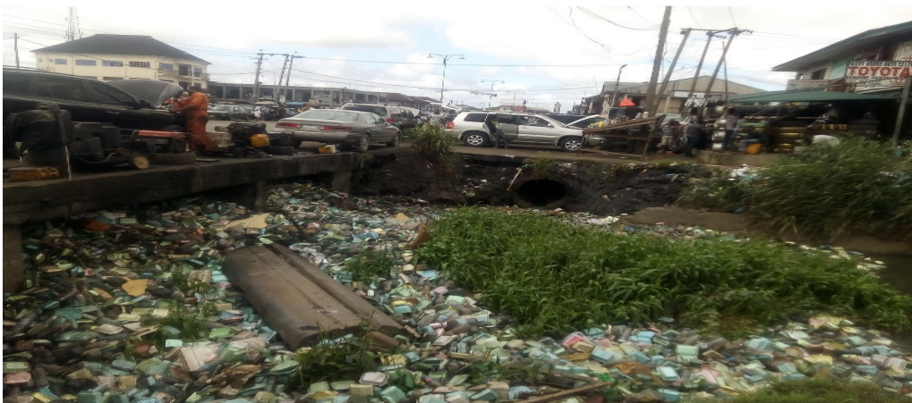
Plate 3. Blockage of water channel with assorted (especially Xenobiotic) waste products associated with anthropogenic activities around the creek in Port Harcourt