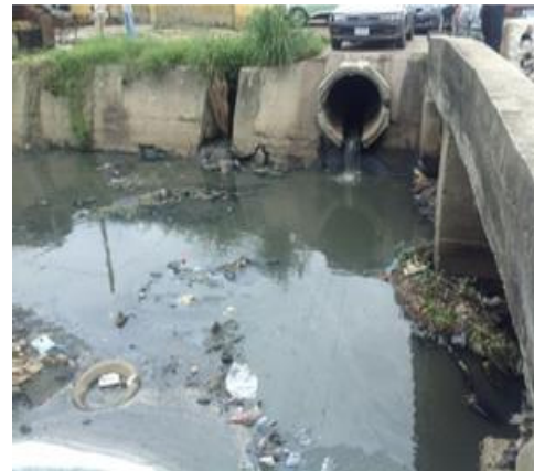
Plate 2. Ntanwogba creek showing discharge of wastewater into the drains