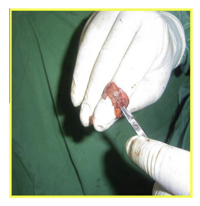
Figure 3 De-fatting of the LMG.

was de-fatted to remove all submucosal tissues (Fig. 3). When needed, the graft was harvested bilaterally.