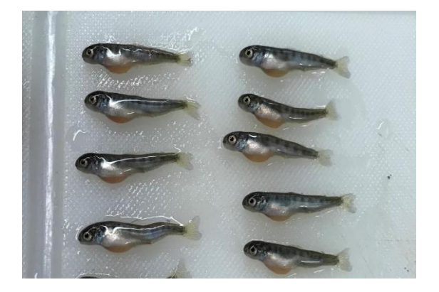
Fig. 2. Showing lethargy, swollen belly, and increased early life-stage mortality due to Thiamine Deficiency in Chinook Salmon. Photo Plate retrieved from Heather, 2022. [41]

Clinically, thiamine deficiency in farmed fish presents with symptoms such as nervous system problems, pale body colour, anorexia, regurgitation of blood, erratic swimming, and physical wounds and haemorrhages on the body surface [39 and 97]. Severe cases can lead to mass mortality, particularly when stocking densities are extremely high. Thiamine deficiency complex (TDC) was first documented in Pacific Coast salmonids in the USA, with Chinook salmon fry exhibiting swimming irregularities, lethargy, swollen belly, and increased early lifestage mortality [41]. Fig. 2: Evaluating Thiamine Deficiency in Chinook Salmon at the Fish Conservation Physiology Hatchery durina fingerling production [41].