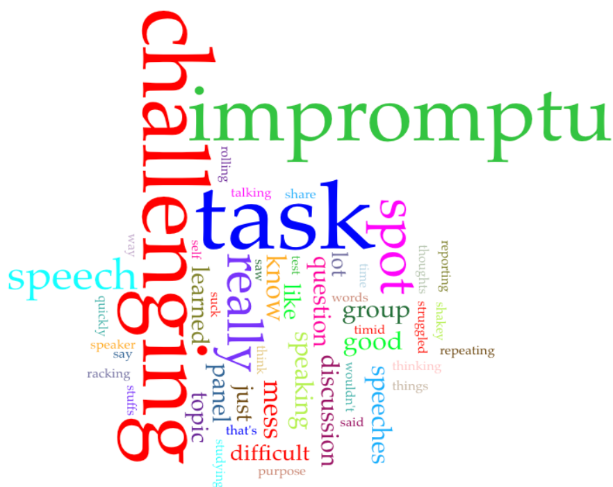
Fig. 5. Tasks found most challenging in a hybrid oral communication class Most frequent words in the corpus: task (10); challenging (9); impromptu (7); spot (4); really (4)

Table 1 summarizes the responses of the interviewees to the question “What do you think is the importance of implementing tasks in an oral communication class?” One of the common responses of the interviewees is that tasks are assigned for students to practice what they have learned from the discussions, which would allow them to hone their skills. The interviewees also expressed that tasks are ideal in making them prepare for real-world scenarios as not all of these could be learned through traditional teaching which includes administering standardized tests.